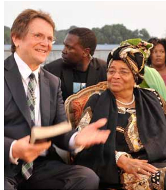
Ellen Johnson Sirleaf is the only female Head of State in Africa. It was a great honour for the Cfan team for the President to attend the campaign.